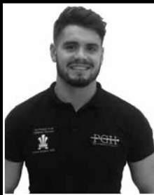
PETER HIGGS Live Honeybee Removal & Pest Expert