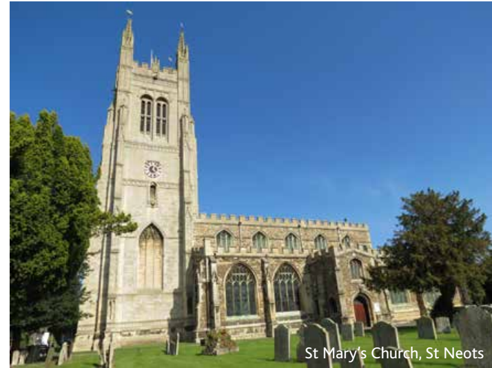
St Mary's Church, St Neots

The ringing floor at the west end of the church was added above the entrance